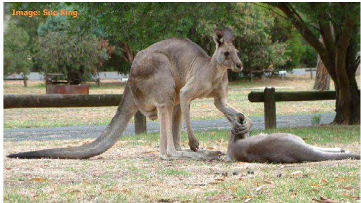
Eastern Grey Kangaroo